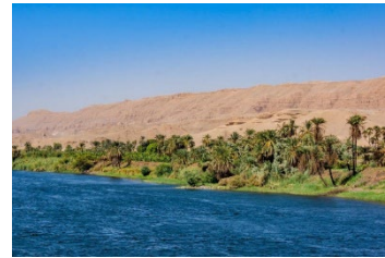
Significance; Cause & Consequence

The River Nile was important to the Ancient Egyptians because it made the soil on the banks of the Nile fertile. The floods meant they could farm and grow food. The River Nile also gave them a way to travel.