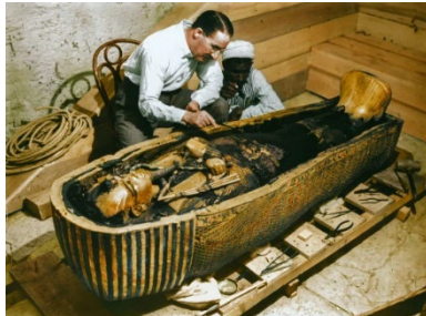
Cause & Consequence

Howard Carter discovered the tomb of Tutankhamun in 1922. His team found a huge amount of artefacts that gave us lots of information about Ancient Egyptians.