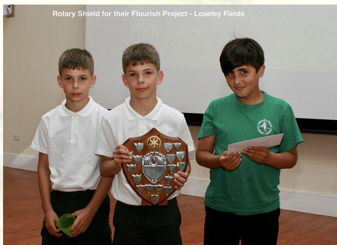
Rotary Shield for their Flourish Project - Loseley Fields